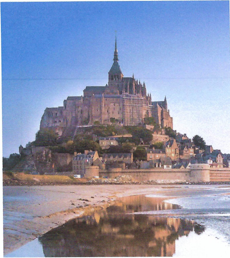
12 Days • 16 Meals: 10 Breakfasts, 1 Lunch, 5 Dinners

HIGHLIGHTS... Versailles Palace & Gardens, Giverny, Normandy, D-Day Landing Sites, Omaha Beach, American Cemetery, Le Mont St. Michel, Loire Valley, Winery Tour, 2-Night Château Stay, Chenonceau Castle, Amboise, Paris, Choice on Tour: Paris City Tour by Bus or Montmartre by Metro Walking Tour, Seine River Cruise, Eiffel Tower Dinner